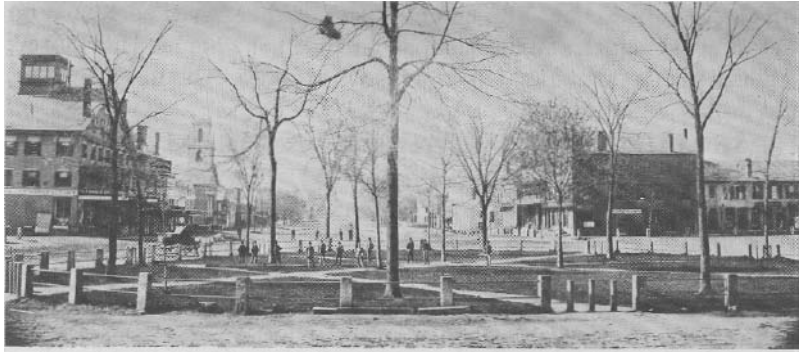
Central Square in the 1860's

and the town is known far and near for its handsome street. It was a cheap way of securing comfort, as well as fame, and I wish that all new towns would take pattern from this. It is best to lay our plans widely in youth, for then land is cheap, and it is but too easy to contract our views afterward. . . . Keene is built on a remarkably large and level interval, like the bed of a lake, and the surrounding hills, which are remote from its street, must afford some good walks. The scenery of mountain towns is commonly too much crowded. A town which is built on a plain of some extent, with an open horizon, and surrounded by hills at a distance, affords the best walks and views."